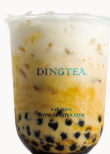
Monster Boba Latté