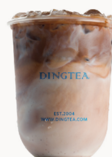
Choloate Oolong Milk Tea