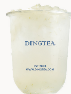
Lychee Ice Tea