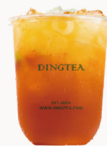
Red Guava Ice Tea