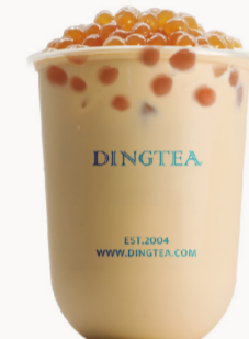
Ding Tea Boba Milk Tea